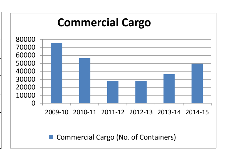
Table (5) Fig (3)